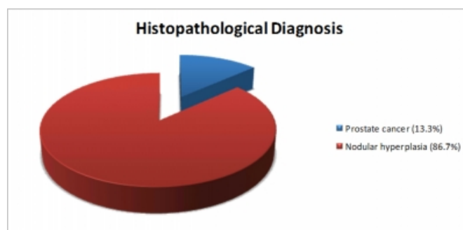
Figure 1: Distribution of histopathological diagnosis

The distribution of the histological diagnosis at various %F/TPSA values revealed that all of the patients with cancer of the prostate had their %F/TPSA values <40 while the majority 81 (93.3%) of the patients with Nodular hyperplasia (BPH) had theirs above 40.