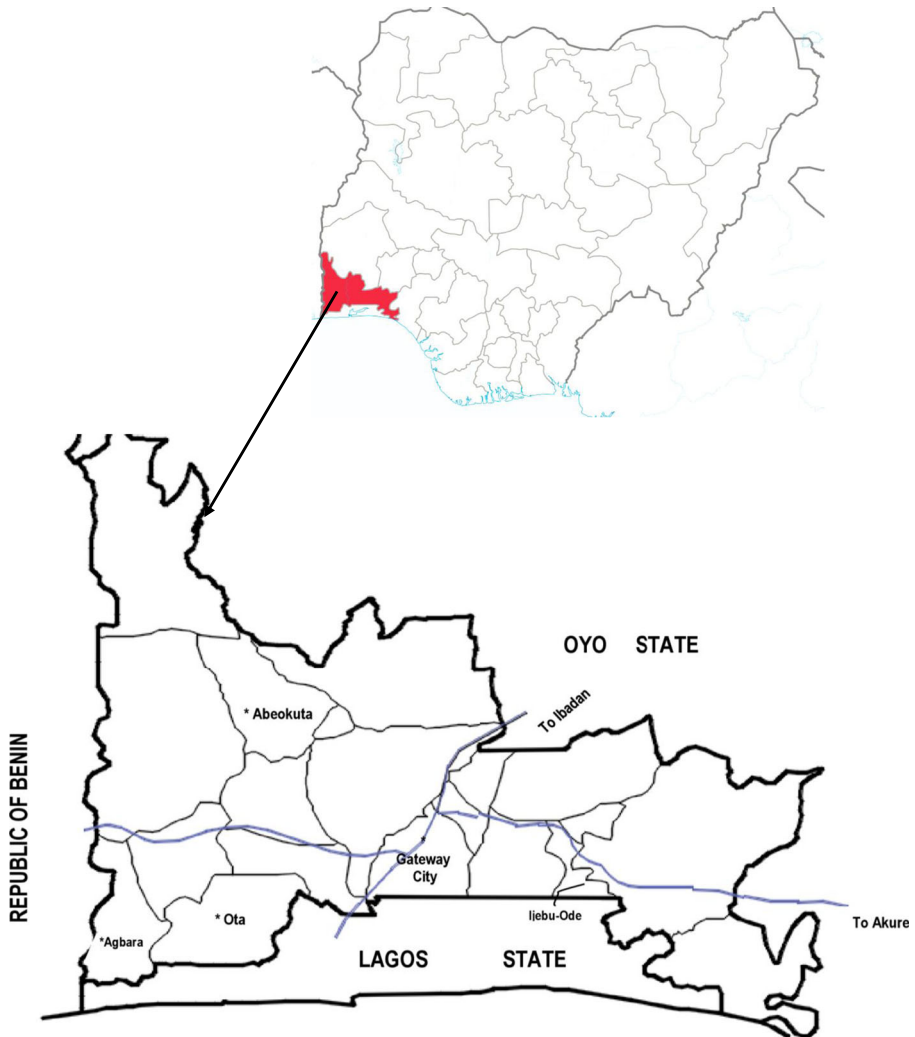
Fig. 1 Map of Nigeria showing the location of Ogun State and housing estates investigated

In fact, a review of the existing theories and conceptual frameworks used in residential/housing satisfaction research reveals that they all seek to provide insight into the various components of the home environment and how residents perceive and evaluate the performance of these components in meeting their current housing needs, expectations and aspirations during or after their housing consumption experience (Vera-Toscano and Ateca-Amestoy 2008; Ibem and Aduwo 2013a). Based on this understanding, the theoretical framework for this study draws on the system approach, housing deficit theory, affective-cognitive model, and actual-aspirational-gap and purposive model.