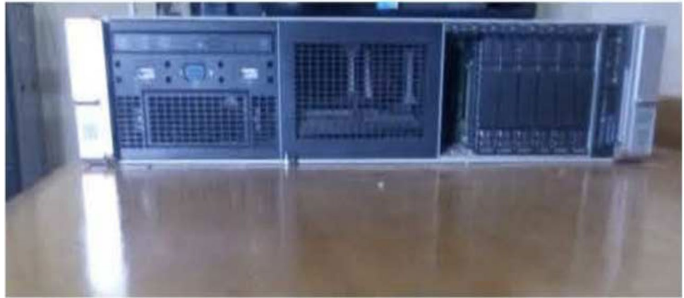
Fig. 2 Dedicated RedCap Server at JUTH

and address any questions or problems encountered by either site. In addition, NU provided periodic hands-on training and REDCap support for the Nigerian teams. This support ranged from troubleshooting issues with data entry to tips on how to use advanced Excel features that interfaced with the database (pivot tables, excel functions, formatting of data, etc.) for cleaning and analyzing data exported from REDCap.