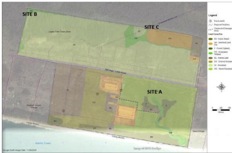
Figure 3: Map Showing Location of Study Sites